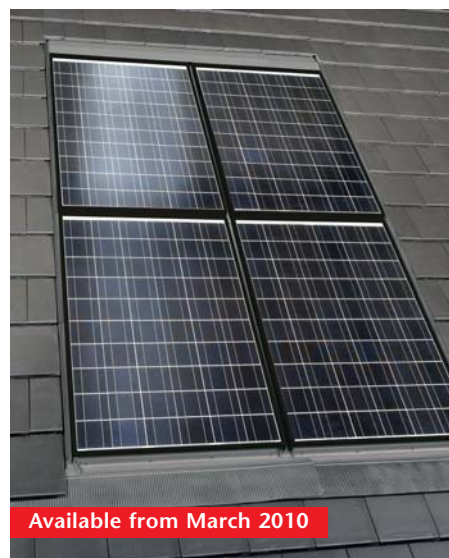
SCHOTT InDaX™ 214/225